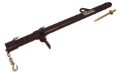
Roof & Engine Pull #2061