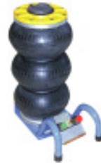
3 Bag Air Jack #5004 Jack w/Oak Block #5006