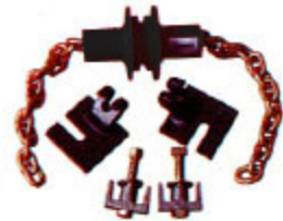
Down Pull Assembly #4069 For channeled treadway racks

Consistent Quality • Stronger Equipment • Maximum Performance Pull after Pull Built Grabber Tough • Backed by Grabber • Committed to the Industry